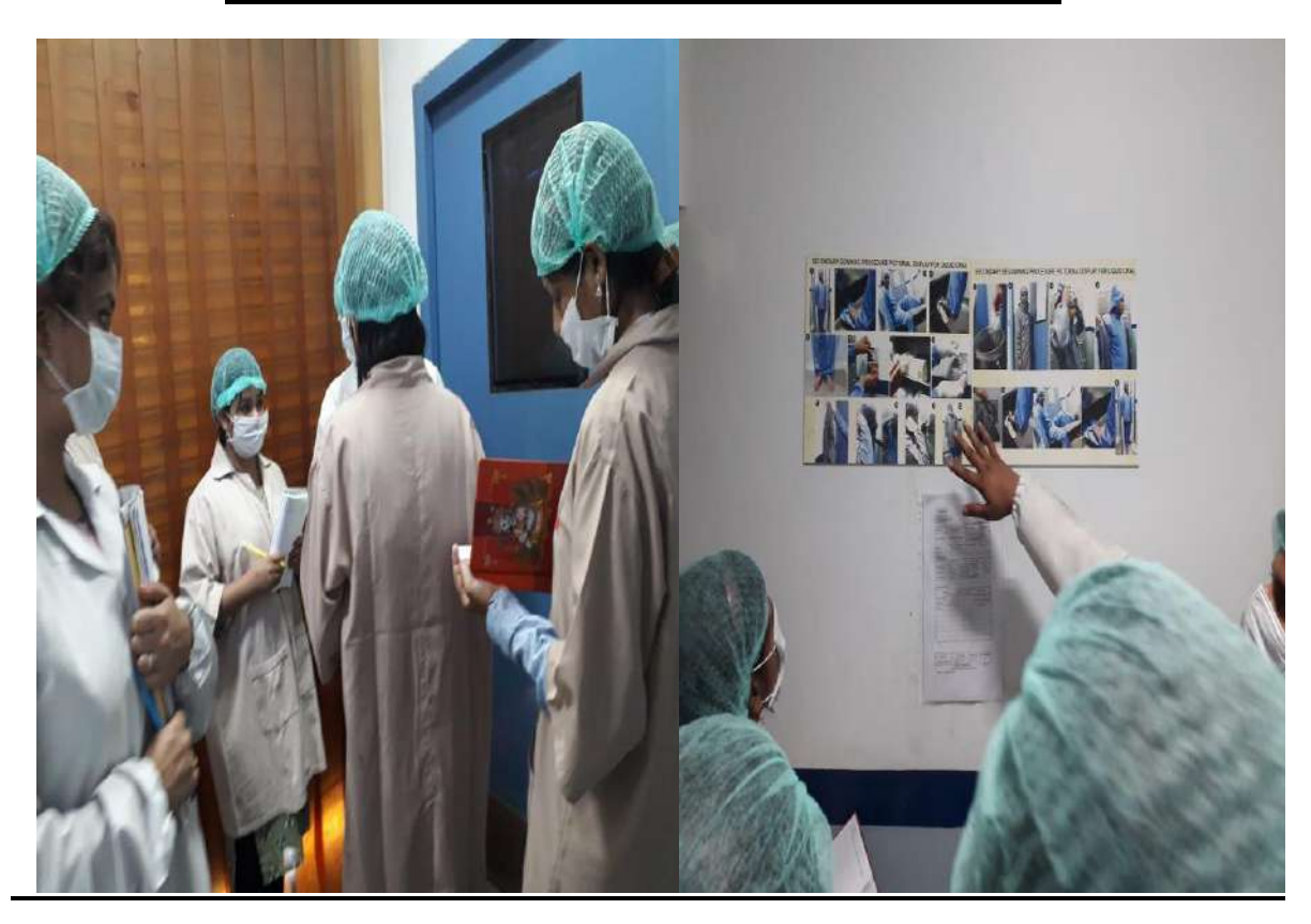
STUDENTS INTERACT WITH THE INSTRUCTOR IN SUNCARE PHARMACEUTICALS