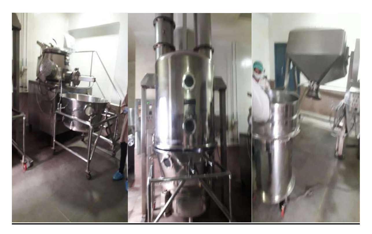
INSTRUMENTS IN SUNCARE PHARMACEUTICALS