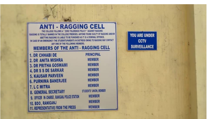
The 24 hour CCTV surveillance renders a feeling of security within the college campus and helps to prevent any untoward incident