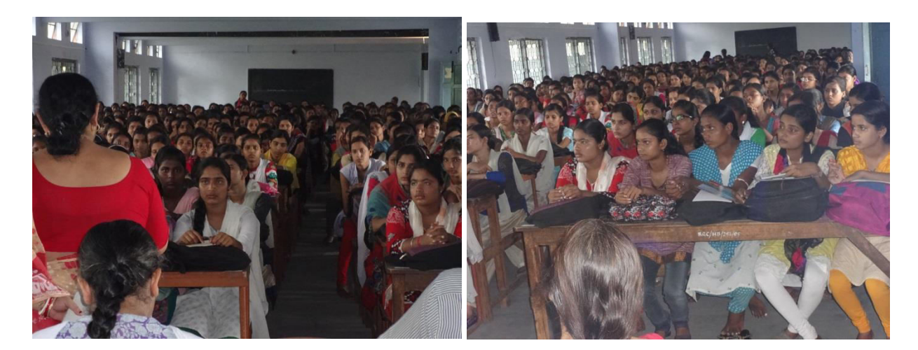
Orientation Programme in progress

At the beginning of each academic session, Orientation programme are organized to make the students aware about the Anti-ragging policies and the existence of the Grievance Redressal Cell in the college.